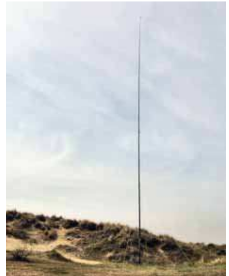
PHOTO 3: The aerial in use at GBOCMS, set up at Caister Lifeboat for International Marconi Day in April 2010.

CONCLUSION. These antennas are very easy to make and only need a few components. If you have little space in your back garden for dipoles a vertical half-wave could be the way to go. Why not try one?