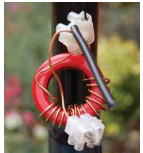
PHOTO 1: The transformer is wound on a T200 (red) toroid. The coax capacitor is connected to the upper terminal block.

showed that halving the frequency meant that I had to multiply the capacitance value